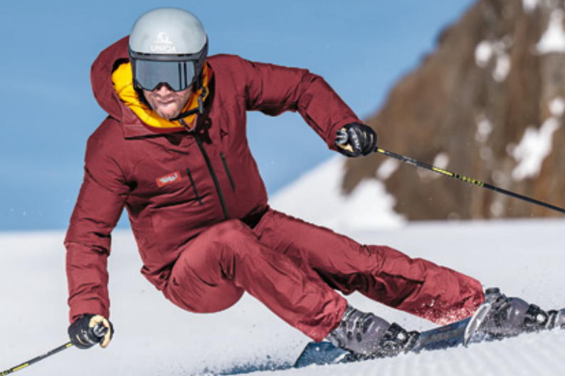
Schöffel Athlet Benni Raich 2x Olympiasieger, 3x Weltmeister